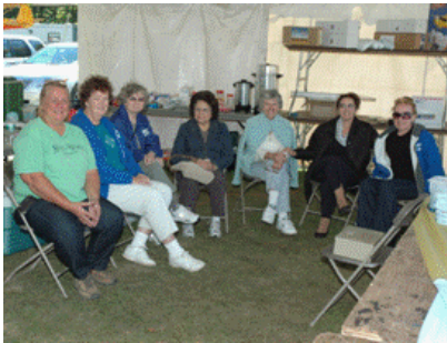
Some of the Ladies who ran the general store, selling hats, t-shirts and raffle tickets. They did a great job. We were out of hats and shirts early on Saturday morning.