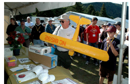
I did not get his name but this gentleman won not only the Friday Raffle he won Saturday's too! One lucky guy!