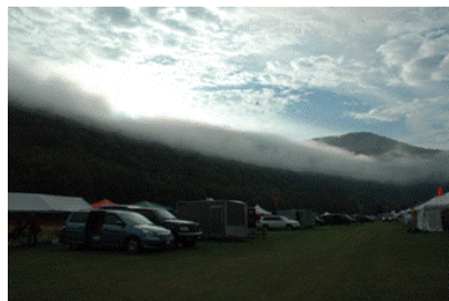
If clear above, there is always a "fog" lying around in the morning at the campsite. It leaves by about 9AM.