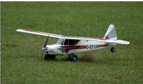
A Mulitplex Fun cub makes a very high-sink rate landing.