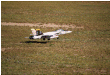
George's show and tell F/A-18 in action