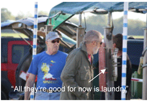
"All they're good for now is laundry"