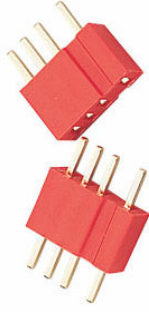
Deans 4-pin (use two pins for + and two for -) For 3-8 amps