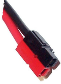
APP (Sermos) For 10 - 45 amps