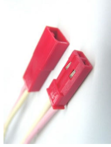
JST type For less than 3 amps

Now that we have determined the approximate amount of current we will need to fly the model, the easiest thing to pick is the connectors appropriate to handle that current . Connectors come in many different shapes and sizes and for the most part is really a preference to the modeler.