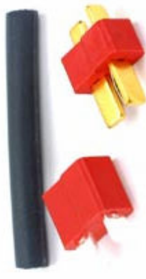
Deans Ultra plug For 20-60 amps